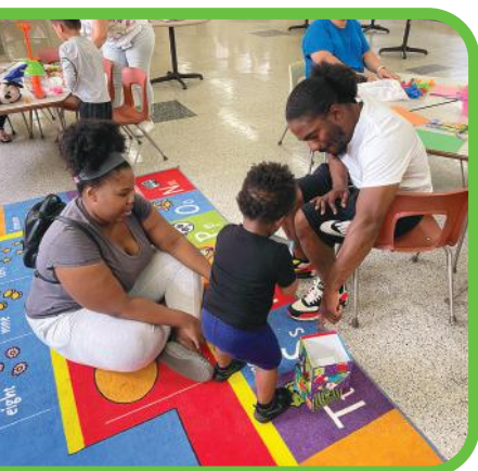
Family building readiness skills at an EPEL Connect and Play group.

Community and Family Engagement Coordinator, EPEL